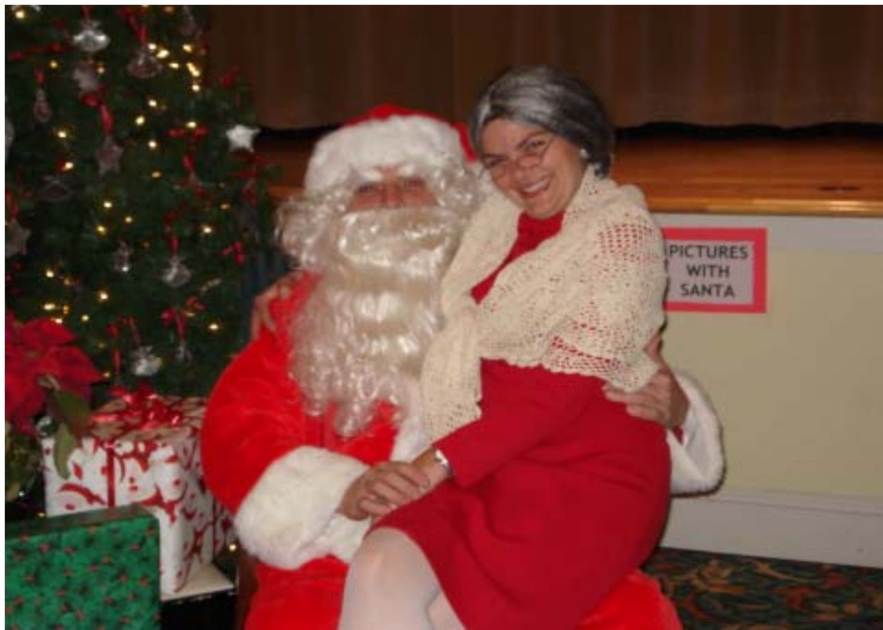
Santa and Mrs. Claus cuddle up at the Project Safe Christmas Party.

The holidays are a time to celebrate what we have and to give to others who may not have as much. The Project Safe holiday party epitomizes this spirit of giving and receiving as staff, volunteers and current and former clients came together in an outpouring of love and goodwill.